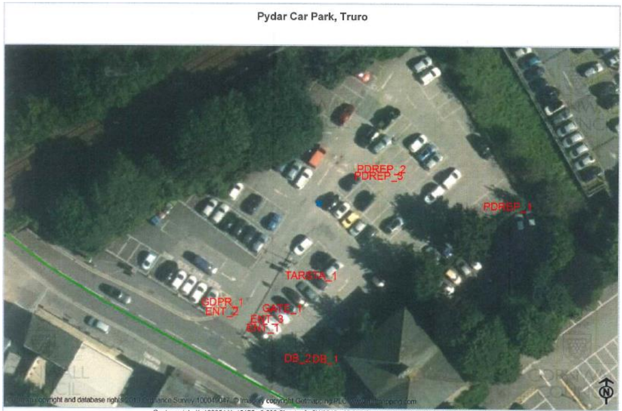
Centre point X: 182354 Y: 45175 2,500 Sheet ref.: SW8245 10,000 Sheet ref.: SW84NW Scale 1:500